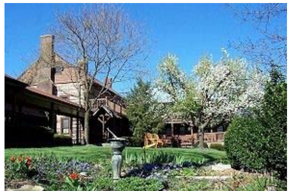
The Inn at Narrow Passage as it looks today.